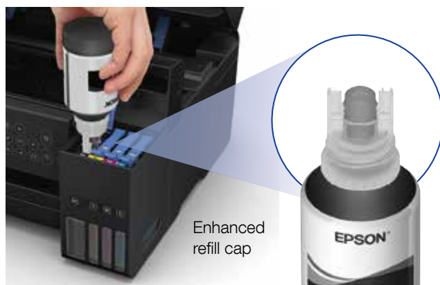
Enhanced refill cap

After printing thousands of pages simply top up the tanks with the affordable and high capacity ink bottles and continue printing.