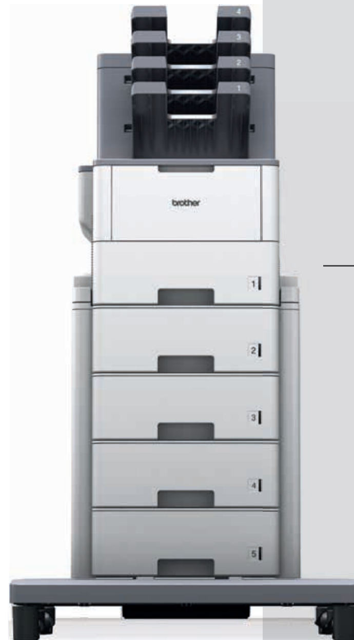
HL-L6400DW plus TT4000 tower tray and MX4000 Mailbox