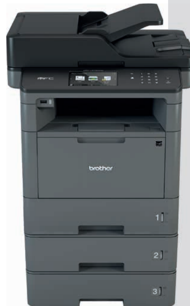
MFC-L5750DW plus 2 x LT6500 lower trays