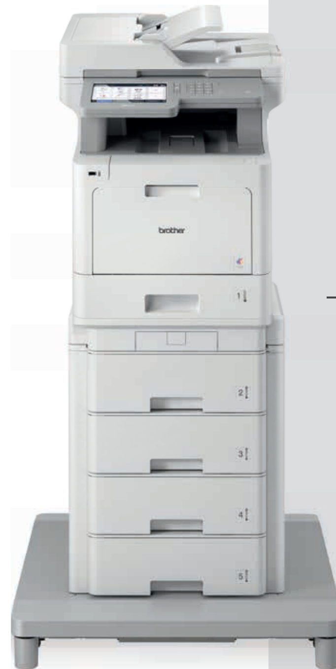
MFC-L9570CDW plus TC4000 tray connector and TT4000 tower tray