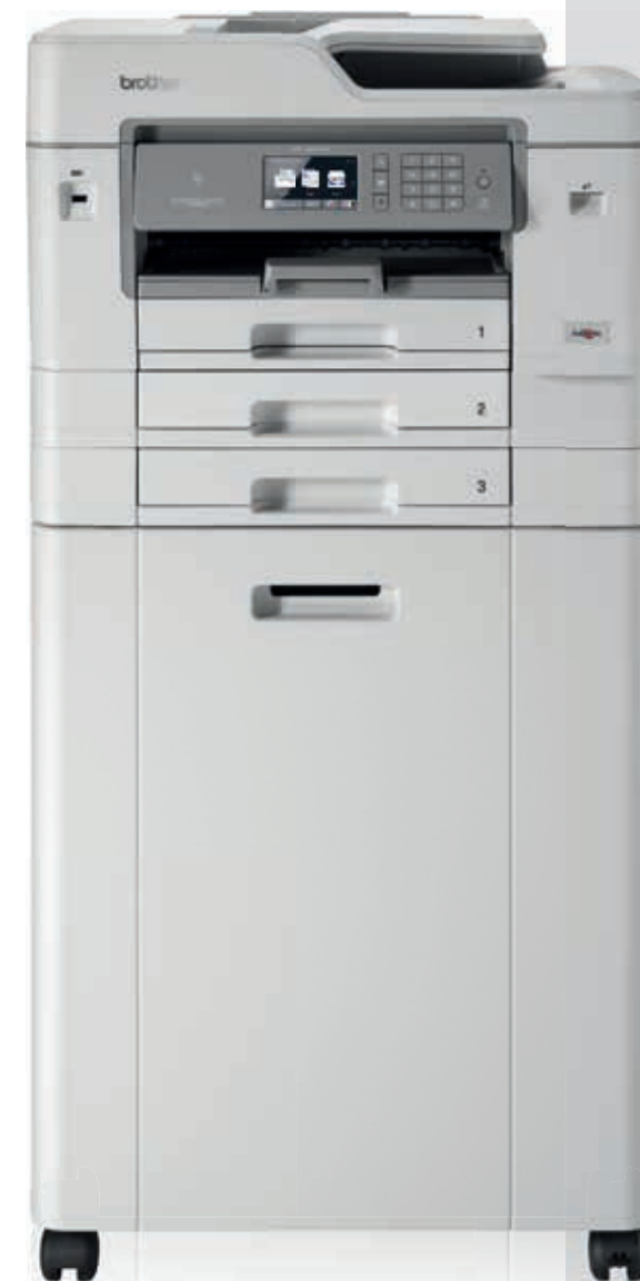
MFC-J6947DW plus cabinet