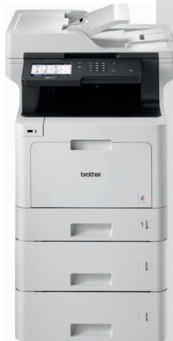
MFC-L8900CDW plus 2 x LT340CL lower tray