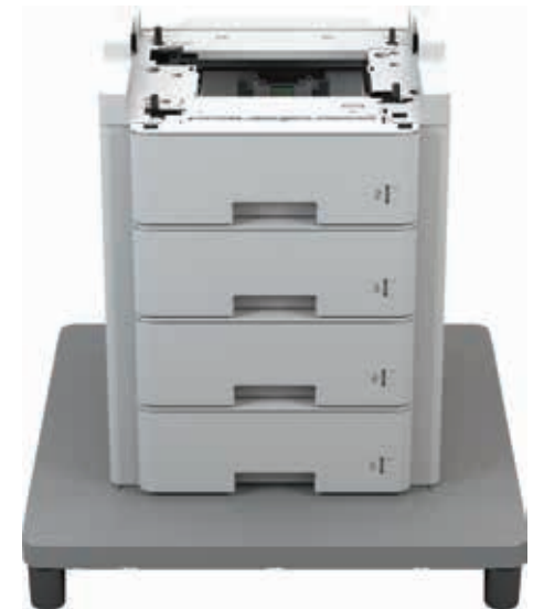
TT4000 tower tray

All models support additional tower tray