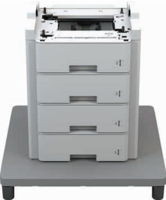
TT4000 tower tray

All models support additional tower tray